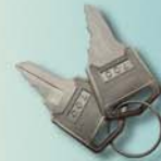
2 Terminal Keys