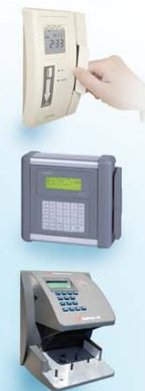
Above: MTX-5 Terminal MTX-20 Terminal HP-50E Hand Punch Clock