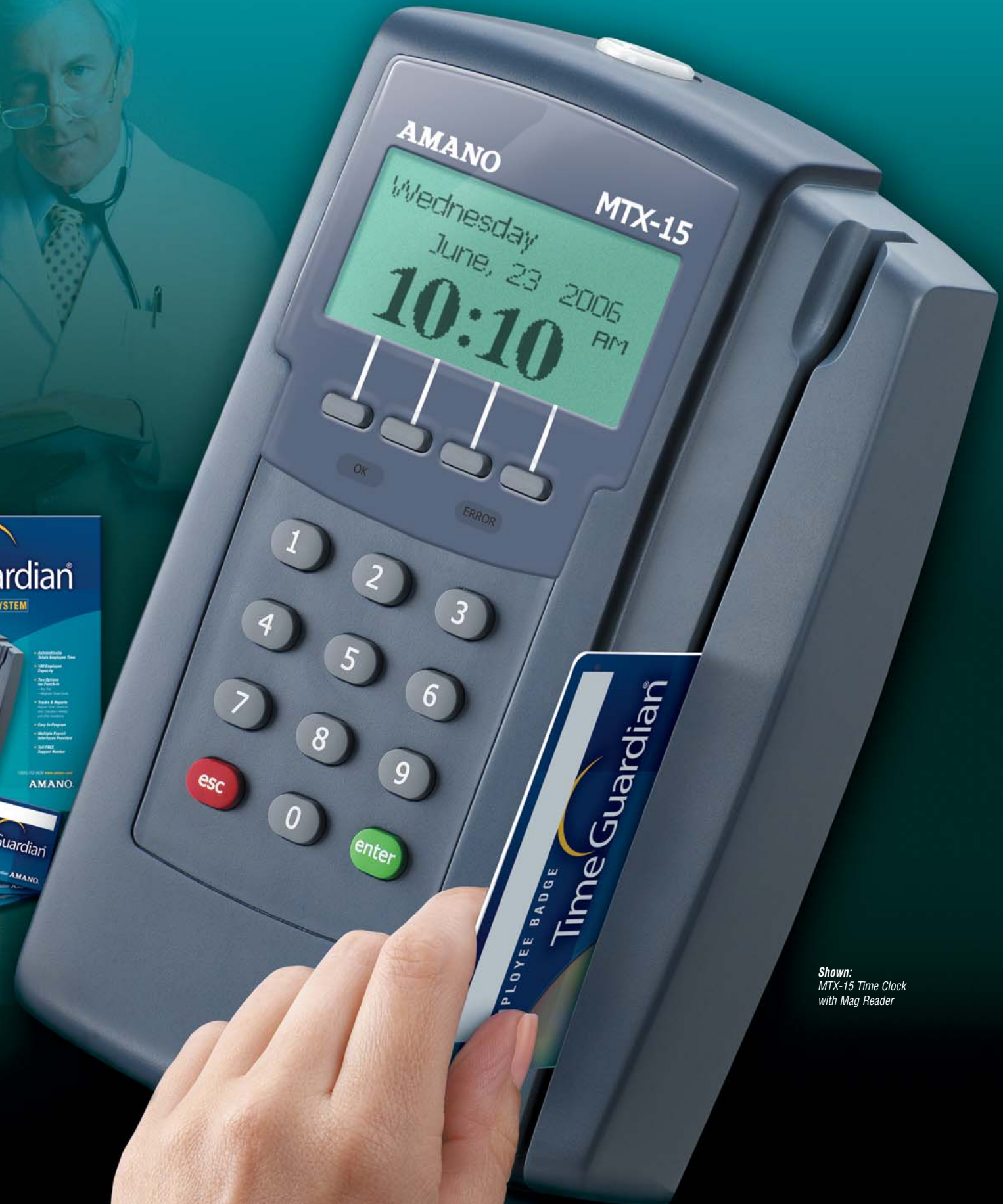
Shown: MTX-15 Time Clock with Mag Reader