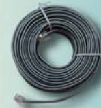
50' Communications Cable